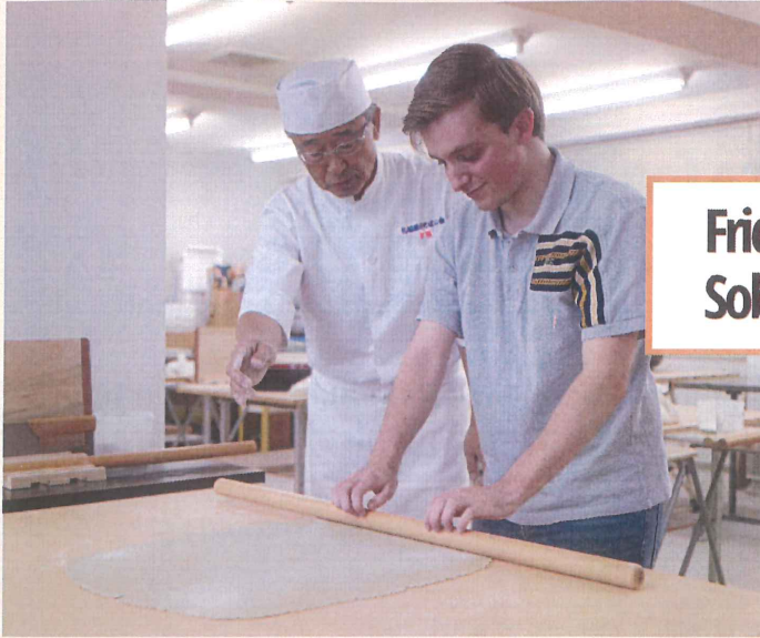
Friday, November 22nd Soba Making Experience