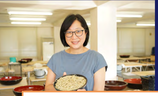
Friday, April 4th Japanese noodle SOBA Making Experience

Tuesday, April 1st Traditional Craft HAKATA DOLLS Painting Experience