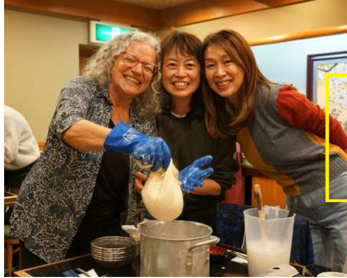
Wednesday, July 30th Let's make and eat! Tofu Making Experience <2,400 JPY>

Friday, Aug 1st International Potluck Party!!! Let's make friends and have fun! <1,500 JPY>