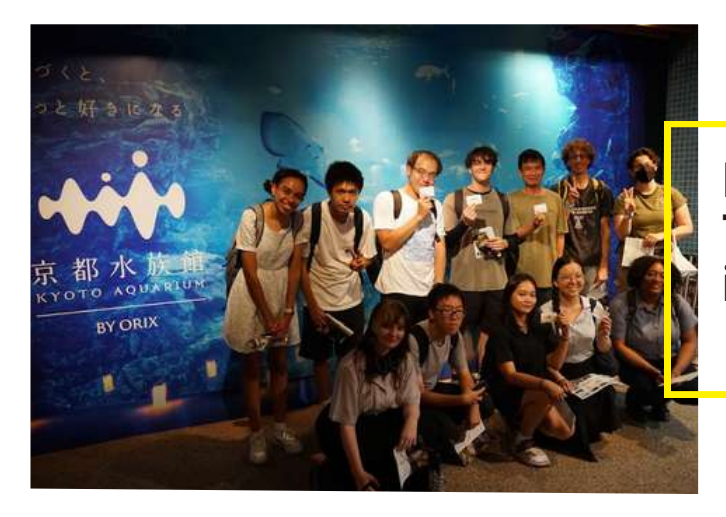
Monday, August 18th Tour Kyoto Aquarium and be healed in the world of the sea! <2,860 JPY>

Friday, August 22nd Summer Course Graduation Party <3,500 JPY>