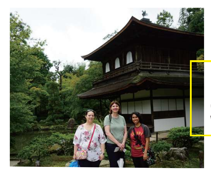
Monday, August 11th Let's Walk While Feeling History! Ginkakuji and Philosopher's Path Walking Tour < 1,000 JPY >

Tuesday, August 12th Suntory's beer factory Tour! < 600 JPY >