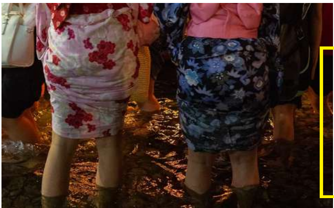
Wednesday, July 23rd Let's enjoy the night in Kyoto! Part 1: Ashitsuke Shrine Ritual, Mitarai Festival @Shimogamo Shrine. <1,000 JPY >

Friday, July 25th Let's go to the Ennichi! Part 2: Kitano Tenmangu Edition < 460 JPY +ACTUAL COST>