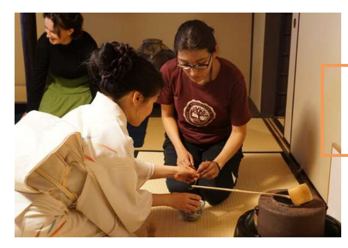
Thursday, July 31st Tea ceremony experience

Tuesday, Aug 6th Japanese Drumming Experience